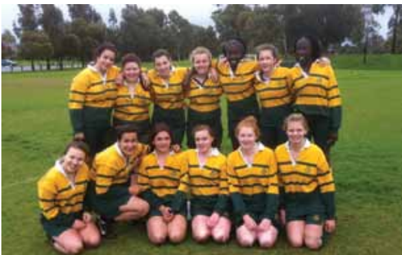
Year 8/9 Girls Rugby League Team

The Year 8/9 girls played off in the grand final finishing as state runners up which was a great effort. Well done to all girls on a superb effort showing determination and grit.