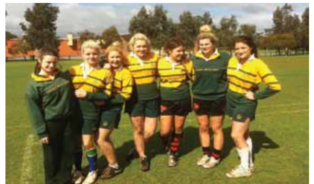
Year 10-12 Girls Rugby League Team