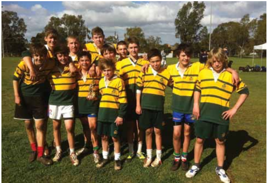
Winning Under14 Boys Rugby Team

Our U14 boys rugby team acquitted themselves well on their most recent outing to claim regional champions in the 11 a side rugby carnival. The boys played with precision and showed great persistence to dominate the other teams winning all games played. Playing five games straight needed a great deal of determination which was displayed by everyone, a truly sterling effort. Well done and congratulations on a very successful season for our U14 team.