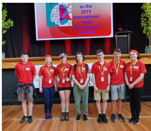
Our Tournament of Minds International Team, above, below and right.